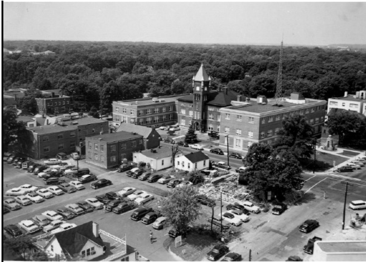
Arlington 1954 – Tree Canopy